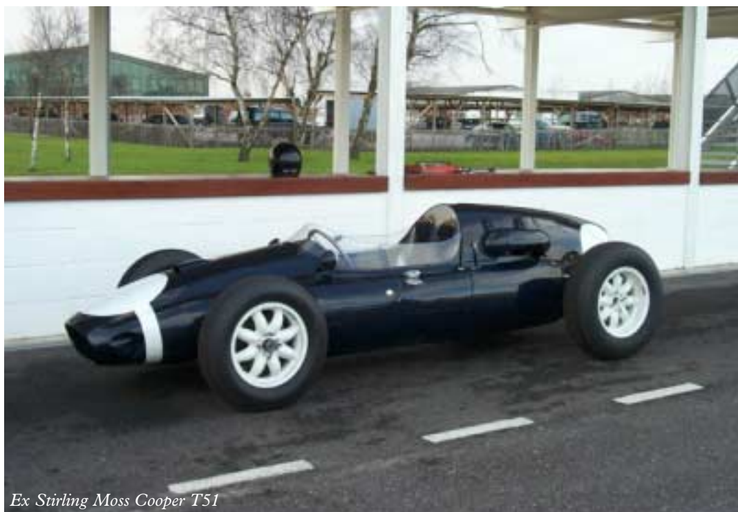
Ex Stirling Moss Cooper T51