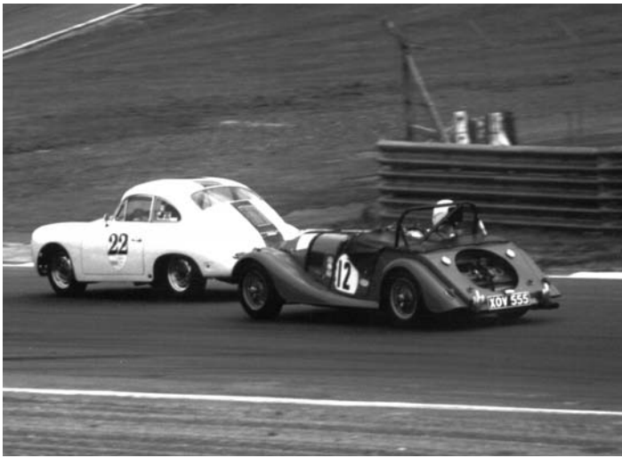
XOV on its way at Brands